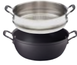
All-Purpose Pot & Steamer Set #2954 $297.50