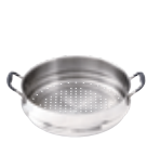
12" Steamer #1385 $110.50