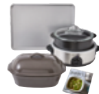
Easy One-Pot Meals Set #HB44 $157.25