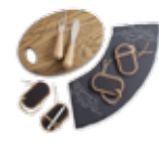
Ash Wood & Slate Cheese Serving Set #1488 $50.50